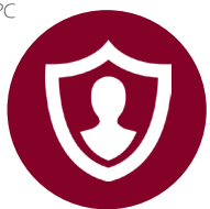
USER PROFILE UNIQUE USER ID & PASSWORD